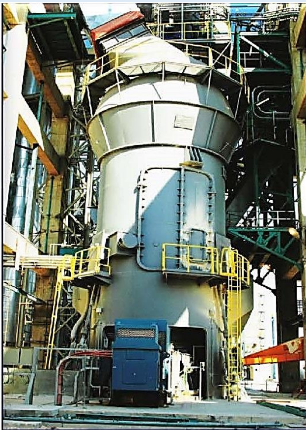
آسياب مواد غلظتي / حماء سوريه